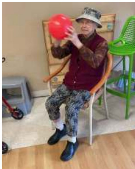
Spot the differences 找不同