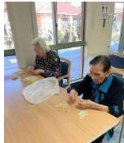
Bean Sprout 摘芽菜