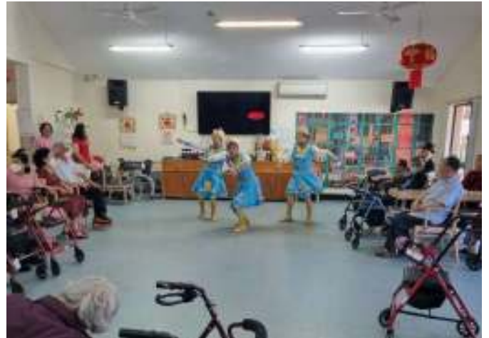
Sydney Dancing group 悉尼爱心歌舞团