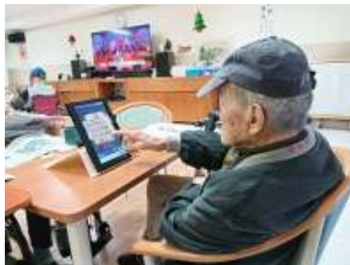
Online Game 綫上游戲