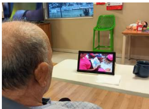
Watching YouTube 看視頻