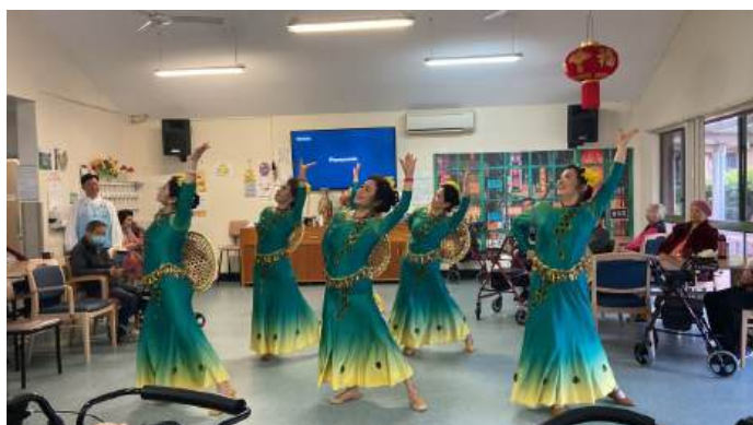
S.H.LK Chinese Opera