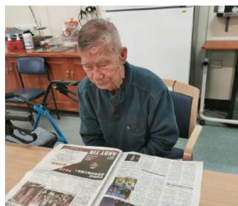
Sing Along 唱歌