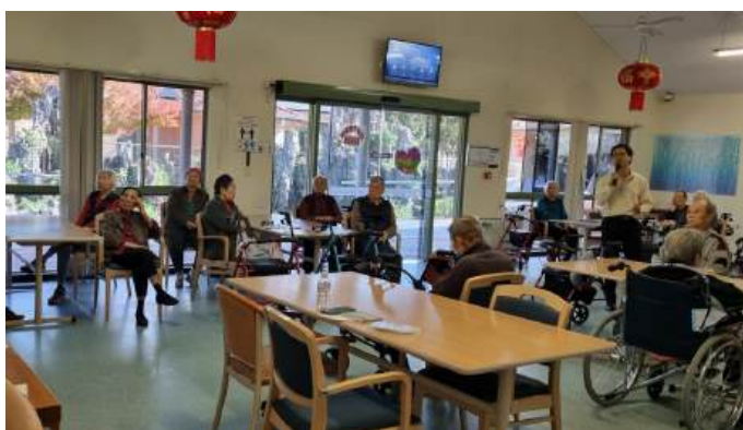
Sydney musical Tang