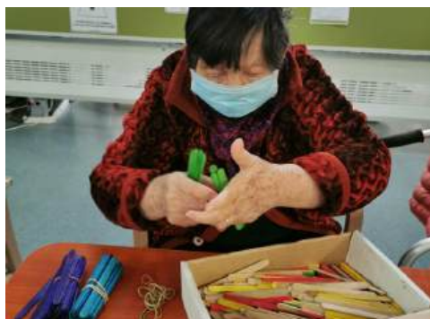
Sorting Colour 顏色分類