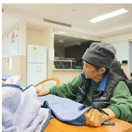
Beans sorting 豆類分選