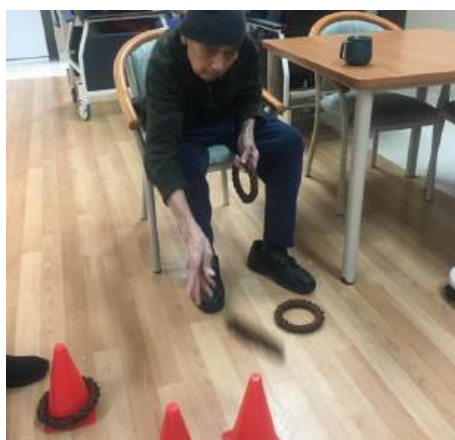
Quoits Game 拋圈圈