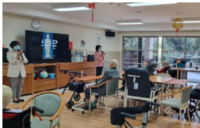
Buddhist chanting group