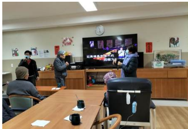
Paramatta Church group