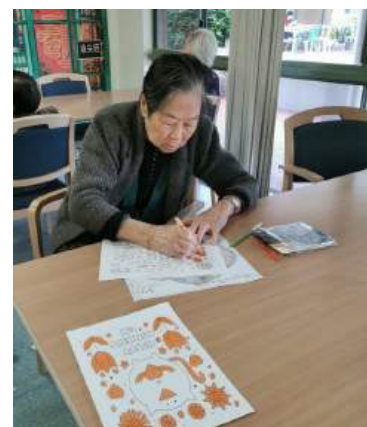
Ping-pong Game 乒乓球遊戲