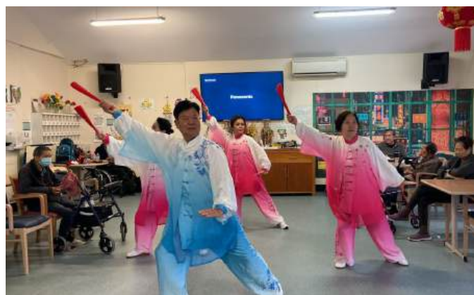
Loves' dancing group